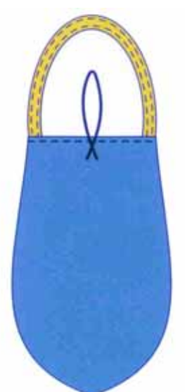
<u>Topstitch top edge of</u> <u>bag:</u> Stitch around top edge of bag.

Instructions for tassel below.I.9. Pull the lining out of the bag enough to stitch the opening closed.20. Arrange the lining